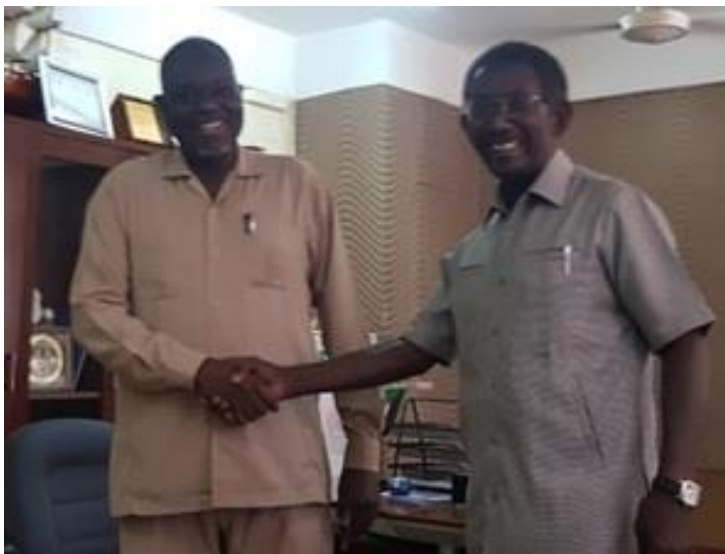
Conclusion to another successful meeting between the Oil minister and Wildcat (5 th October 2023)