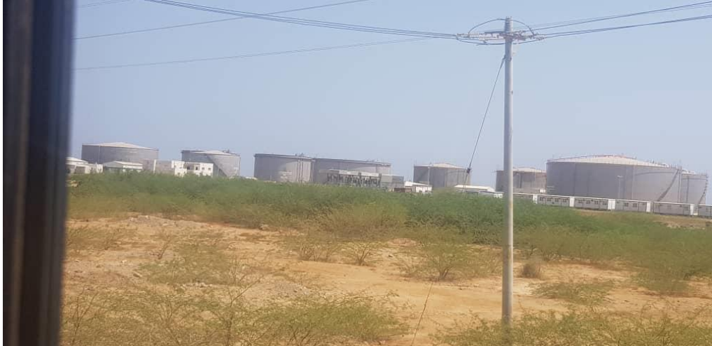
Undamaged Port Facilities at Port Sudan